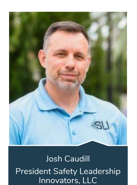
Building the Bridge: Attracting, Promoting and Supporting Women in the Construction Industry